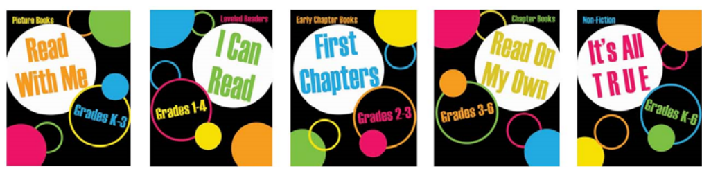
Elementary & K-8 fairs are divided based on reading level and type of book.

Most books are 20-40% off the retail price.